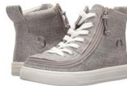
BILLY FOOTWEAR SHOP NOW