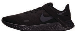
NIKE FLYEASE SHOP NOW