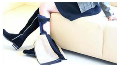
TREND-ABLE SHOP NOW