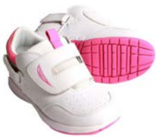
HATCHBACK FOOTWEAR SHOP NOW

Having cerebral palsy can mean challenges finding well-fitting shoes that can fit over AFO's or work with various types of feet at all ages. A new pair of holiday shoes that fit may be just the ticket! Here are some of our favorites for all ages.